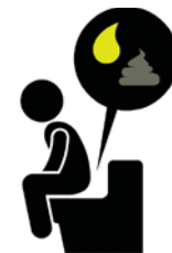
Dark urine, pale stools, and diarrhea

If you think you have hepatitis A because of these symptoms, see your doctor or visit the closest Emergency Room. Always wash your hands with soap and water after going to the bathroom and before preparing food.